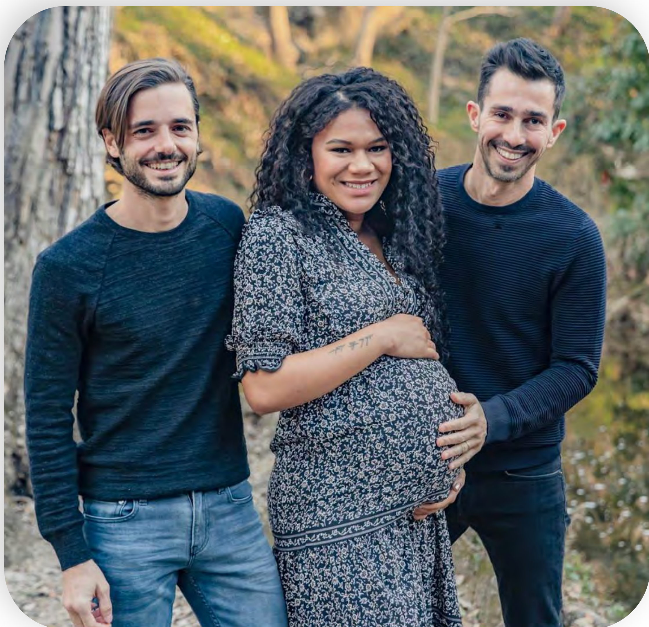
Hatch Intended Parents & Surrogate